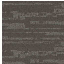
Fast Date - 673