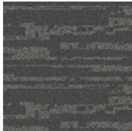
Fast Date - 672