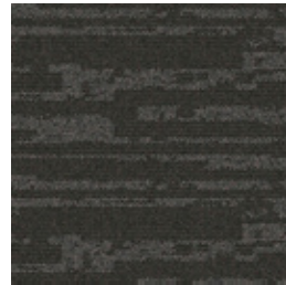
Fast Date - 676