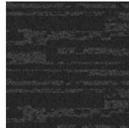
Fast Date - 677