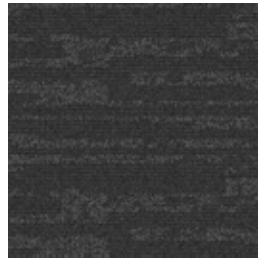
Fast Date - 675