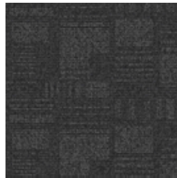
Fast Talk - 675