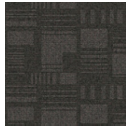
Fast Talk - 676