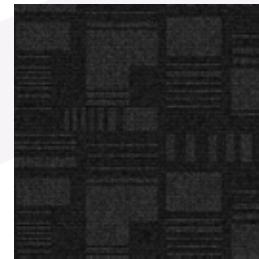
Fast Talk - 678