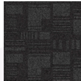
Fast Talk - 677