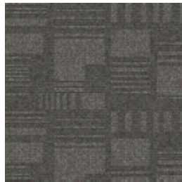
Fast Talk - 673