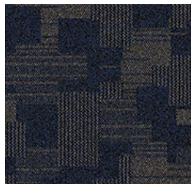
TEMPO - 557