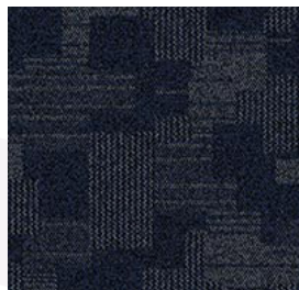
TEMPO - 6557