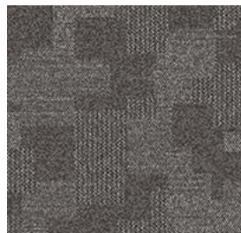
TEMPO - 6543