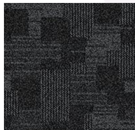
TEMPO - 6578