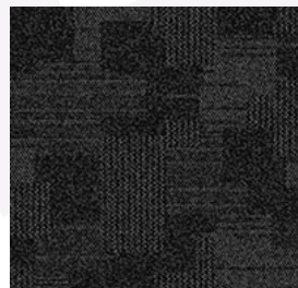
TEMPO - 6579