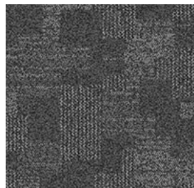
TEMPO - 6576