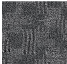
TEMPO - 6571