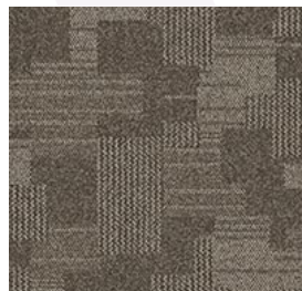
TEMPO - 6545