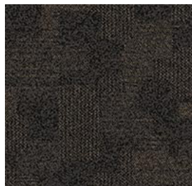
TEMPO - 548